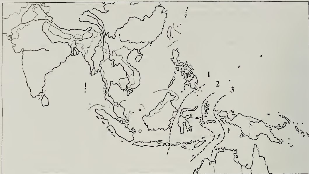
Fig. 3. The Oriental and Papuan-Australian area of faunal transition and the important zoogeographic lines. 1: Wallace's line; 2: Weber's line; 3: Lydekker's line.

Papuan (and Australian) faunal province(s) proper.